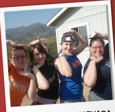
FUN TIMES IN ENSENADA