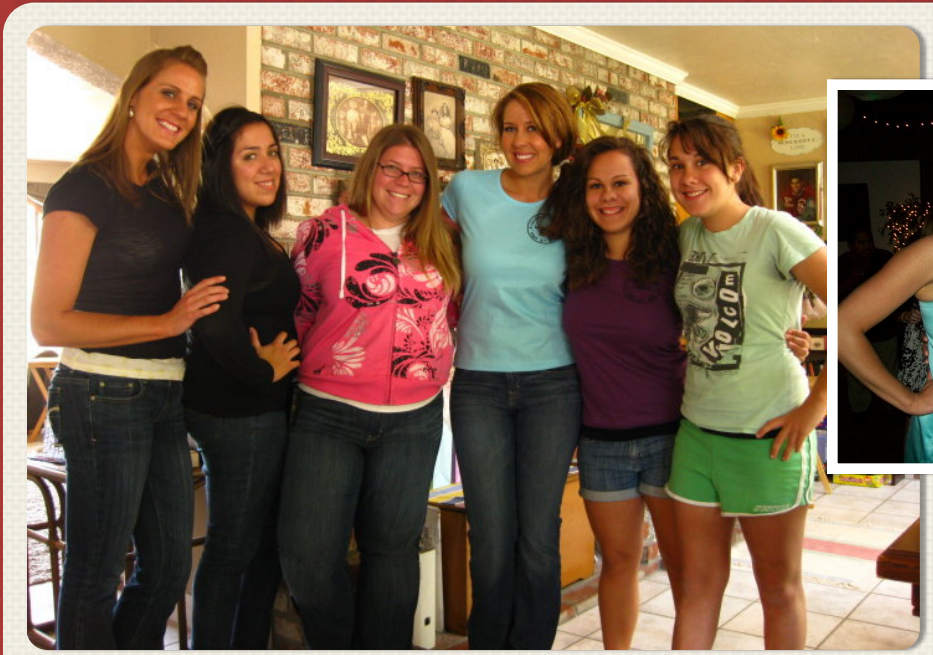
WOW HAVE I BEEN BUSY!!

NEW JOB, NEW HOUSE, NEW FRIENDS, NEW ROOMIES, VISIT TO NORCAL AND OREGON, ETC.