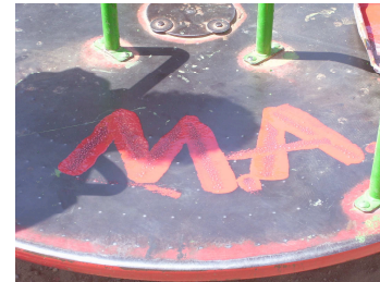
Spring Break Mission Adventures 2007