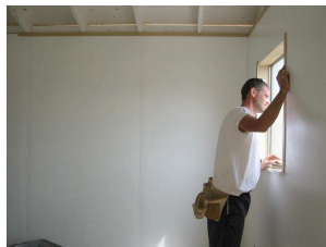
Give away a house to a family in need in Mexico. Find out how you can get involved.