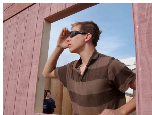
Searching for something meaningful to do with your time ?