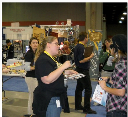
CONFERENCES IN NOVEMBER