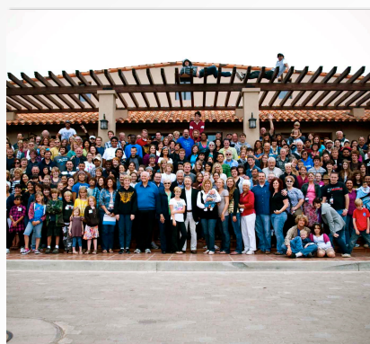
50TH CELEBRATION IN SEPT