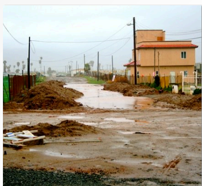
FLOOD RELIEF IN JANUARY

next year's MA theme and I represented YWAM San Diego/Baja at 4 different conferences telling people about our ministries. I was then able to go home for Thanksgiving for the first time in 5 years and that was amazing!! The Lord has blessed me with so many wonderful opportunities this past year. Thank you for being a part of my year & I pray blessings on you & your family.