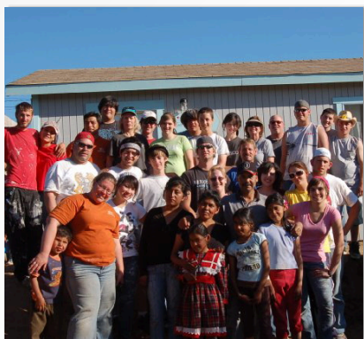
MA W/SHELTER COVE IN APRIL