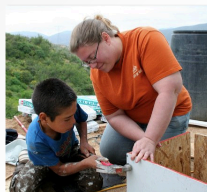
HOUSE BUILD IN MARCH