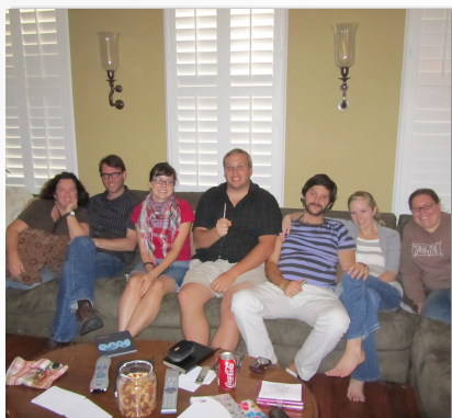
MA THEME TEAM IN OCTOBER