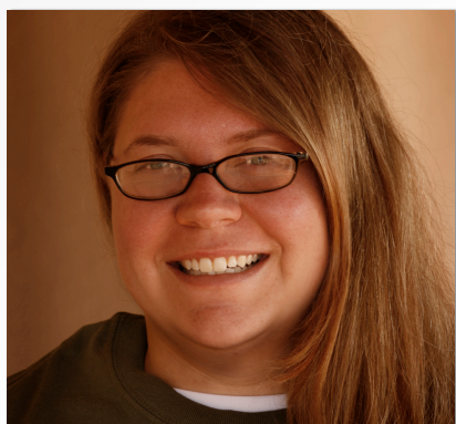
MA TEAMS IN JULY