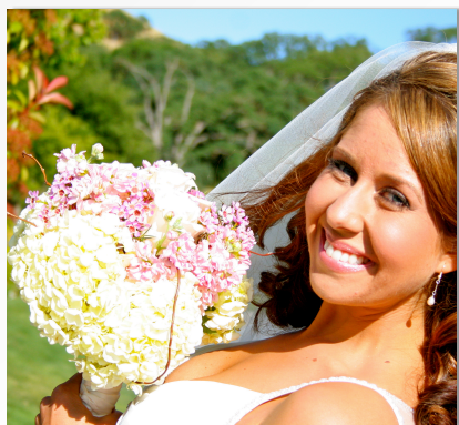
WEDDING IN MAY