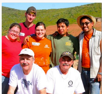
HOUSE BUILD IN FEBRUARY