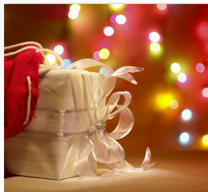
CHRISTMAS IN DECEMBER